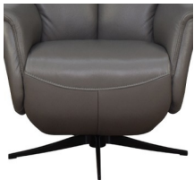
BLACK PRONG BASE