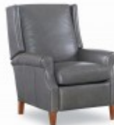
SKU L1375-05MR Wesley