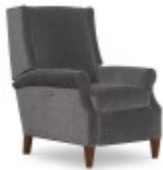
SKU 1375-05PR Wesley