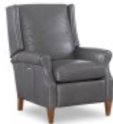
SKU L1375-05PR Wesley