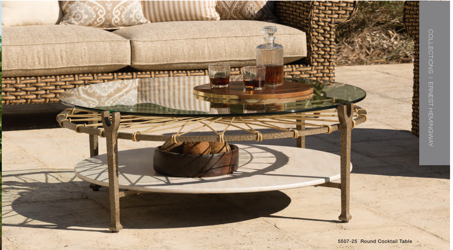
5507-25 Round Cocktail Table