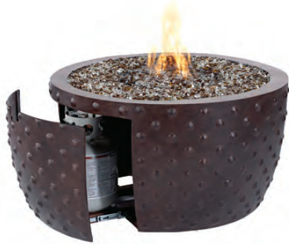
DETAIL: SLIDE OUT DRAWER GAS TANK NOT INCLUDED