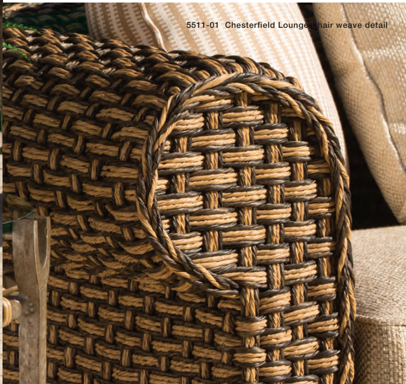
5511-01 Chesterfield Lounge Chair weave detail