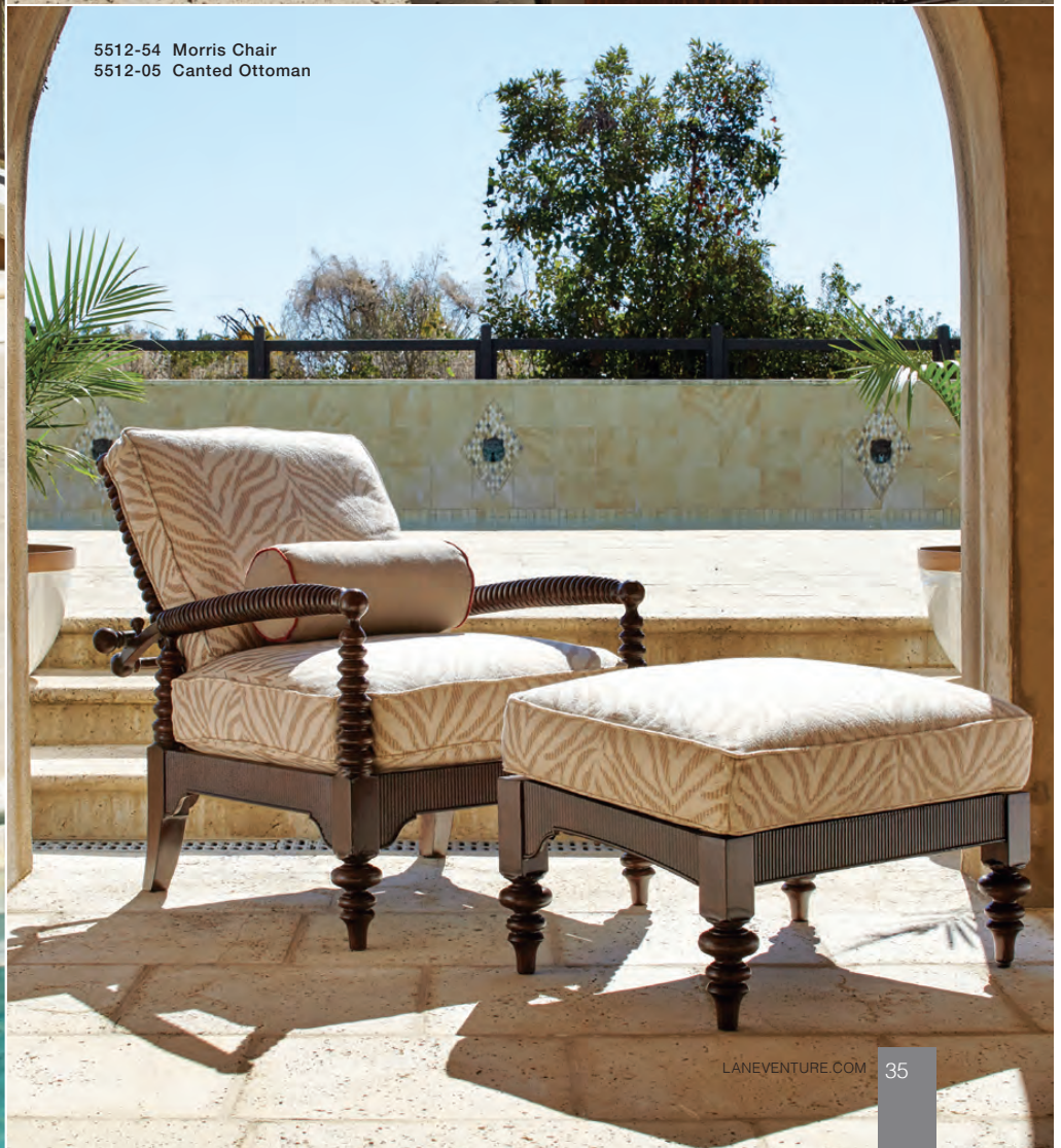
5512-54 Morris Chair 5512-05 Canted Ottoman