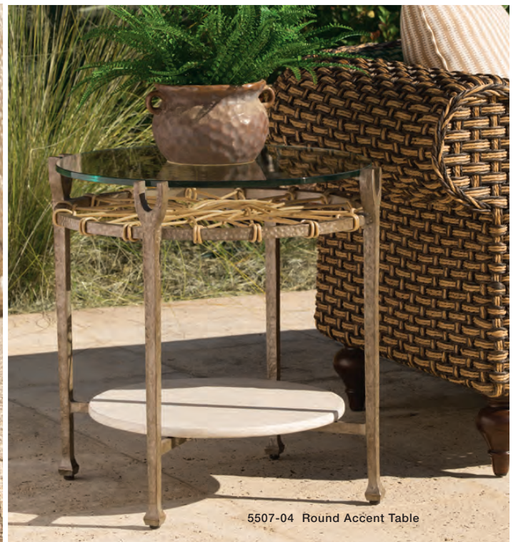
5507-04 Round Accent Table