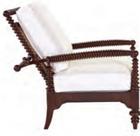
5512-54 MORRIS CHAIR OVERALL: W32 D43 H41 ARM H25 SEAT: W23 D22 H20 MATERIALS: Cast aluminum powder-coated frame Hand-woven synthetic wicker back panel. FINISH: Walnut finish with warm highlights. Available only as shown. FEATURES: Bobbin-turning arm. 3 Position reclining back.