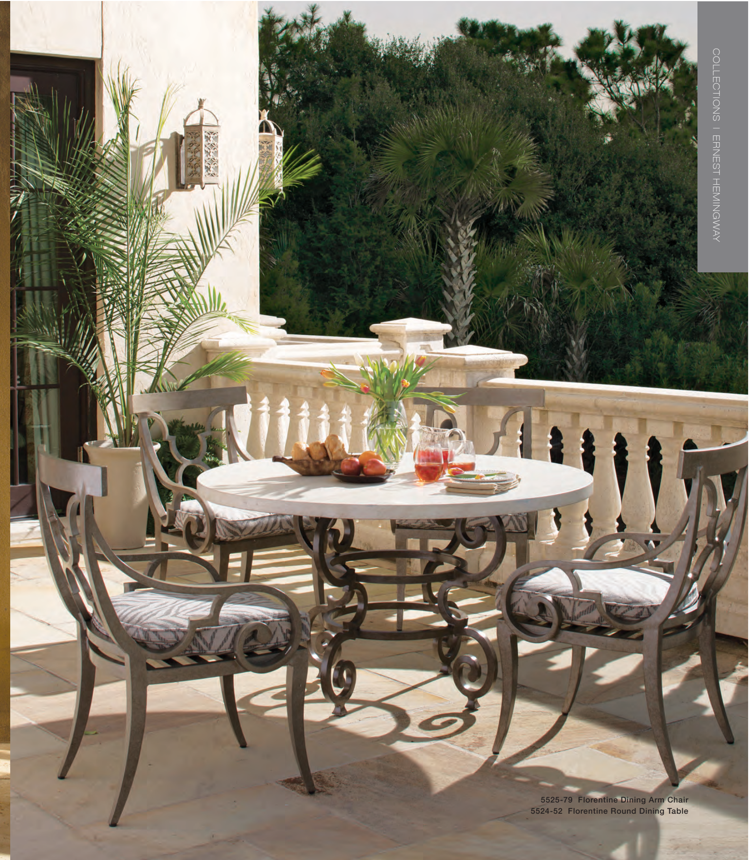
5525-79 Florentine Dining Arm Chair 5524-52 Florentine Round Dining Table