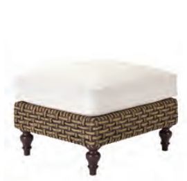
5511-05 CHESTERFIELD OTTOMAN

FEATURES: Cast aluminum turned legs, 2 pillow back.