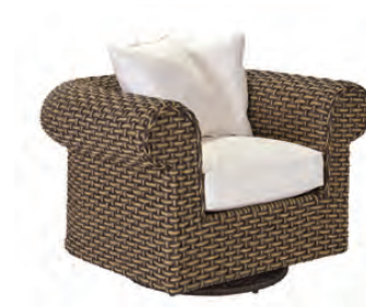
5511-86 CHESTERFIELD SWIVEL GLIDER LOUNGE CHAIR

FEATURES: Cast aluminum turned legs, 5 pillow back.