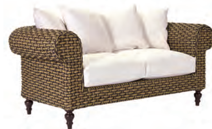
5511-02 CHESTERFIELD LOVESEAT