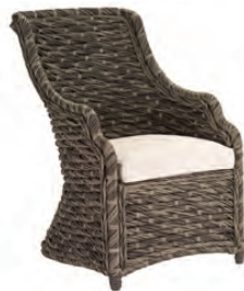
5501-79 ACCENT DINING ARM CHAIR OVERALL: W25 D31 H38 ARM H26 SEAT: W20 D20 H19 MATERIALS: Hand-woven synthetic weave over powder-coated aluminum frame. FINISH: Weathered Driftwood finish. Available only as shown.