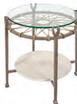
5507-04 ROUND ACCENT TABLE OVERALL: W25 D25 H24 MATERIALS: Cast & wrought aluminum frame. Tempered glass top, synthetic wicker weave. Glass reinforced concrete bottom shelf. FINISH: Hammered Gun Metal finish. Available only as shown. FEATURES: Synthetic cording in tribal "drum" pattern. Suspended tempered glass above the woven décor. Cast aluminum legs.