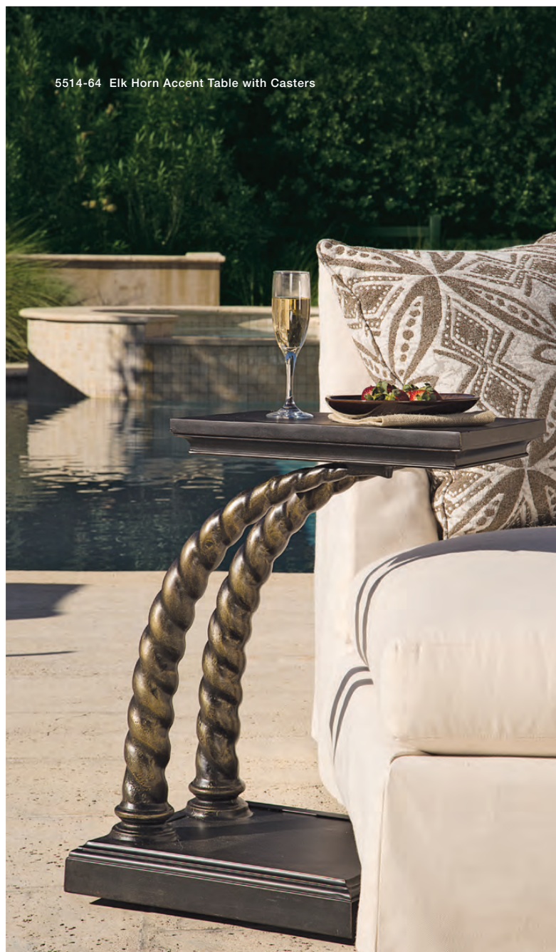
5514-64 Elk Horn Accent Table with Casters