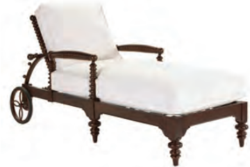
5512-64 ADJUSTABLE CHAISE OVERALL: W32 D81 H41 ARM H25 SEAT: W23 D47 H20 MATERIALS: Cast aluminum powder-coated frame. Hand-woven synthetic wicker back panel. FINISH: Walnut finish with warm highlights. Available only as shown. FEATURES: Bobbin-turning arm. 5 Position reclining back. Lays flat.