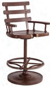
5516-52 MARLIN SWIVEL BAR STOOL OVERALL: W25 D26 H47 ARM H36 SEAT: W19 D19 H31 MATERIALS: Cast aluminum powder-coated frame. FINISH: Walnut finish with warm highlights. Available only as shown. FEATURES: Memory swivel returns chair to position.