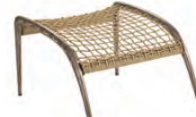
5515-05 CANTED OTTOMAN (MATCHES 5515-01) OVERALL: W24 D27 H16 MATERIALS: Hand-woven synthetic wicker weave over cast aluminum powder-coated frame. FINISH: Gun Metal finish with golden highlights. Available only as shown.