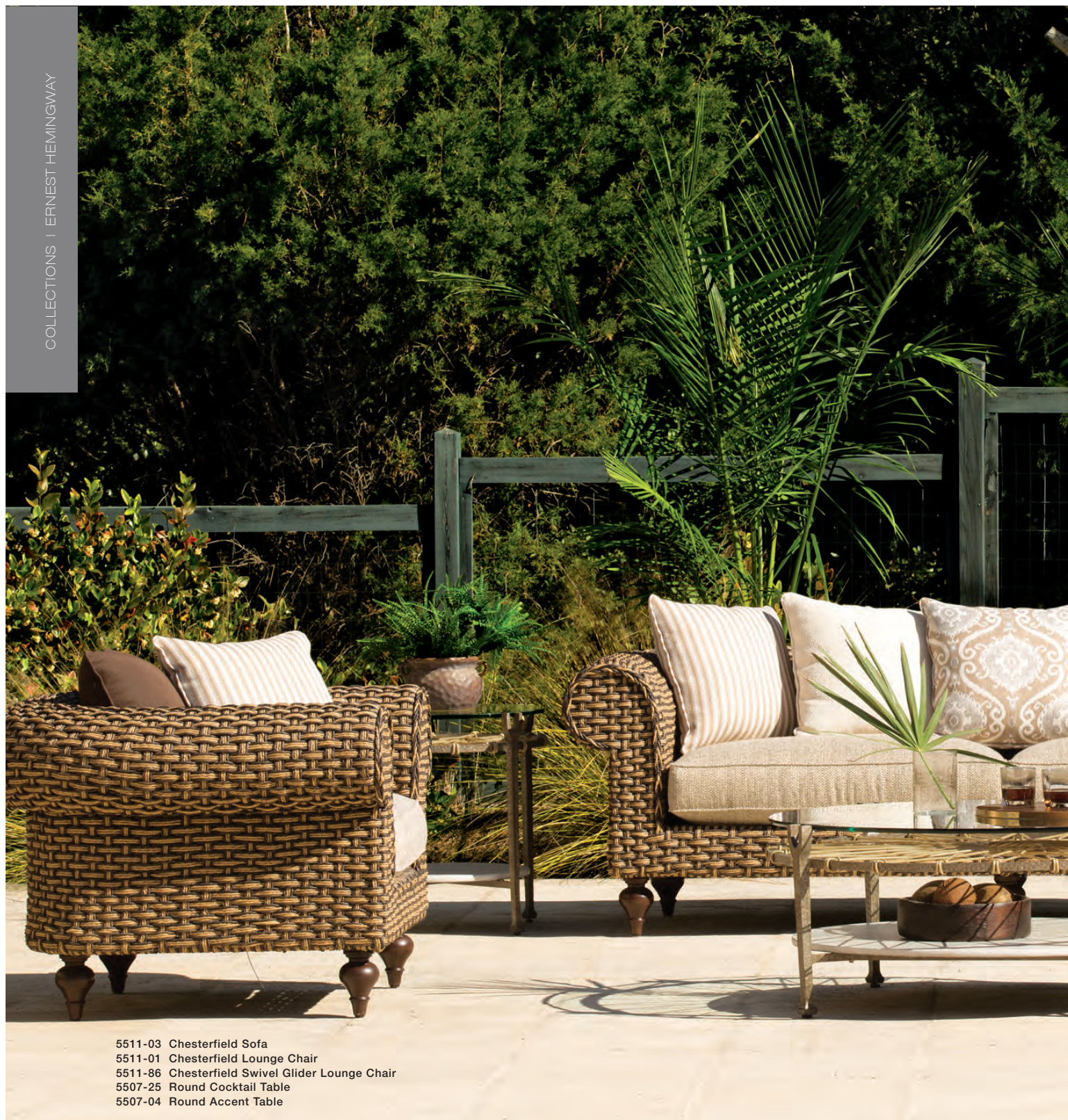
5511-03 Chesterfield Sofa 5511-01 Chesterfield Lounge Chair 5511-86 Chesterfield Swivel Glider Lounge Chair 5507-25 Round Cocktail Table 5507-04 Round Accent Table