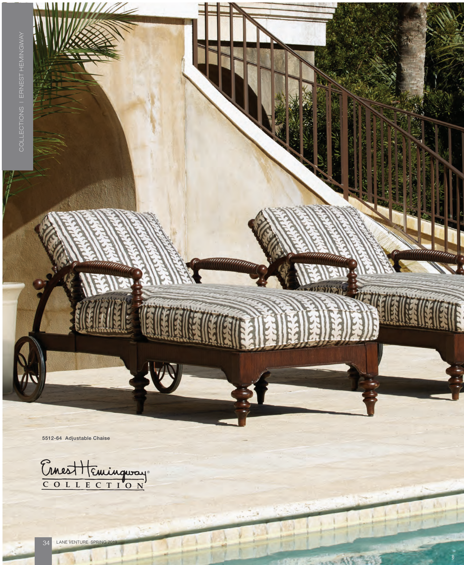
5512-64 Adjustable Chaise