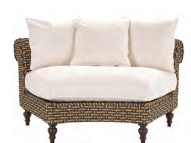
5511-16 CHESTERFIELD CRESCENT WEDGE