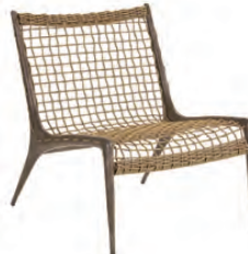
5515-01 OCCASIONAL CHAIR OVERALL: W28 D35 H34 SEAT: W25 D22 H17 MATERIALS: Hand-woven synthetic wicker weave over cast aluminum powder-coated frame. FINISH: Gun Metal finish with golden highlights. Available only as shown.