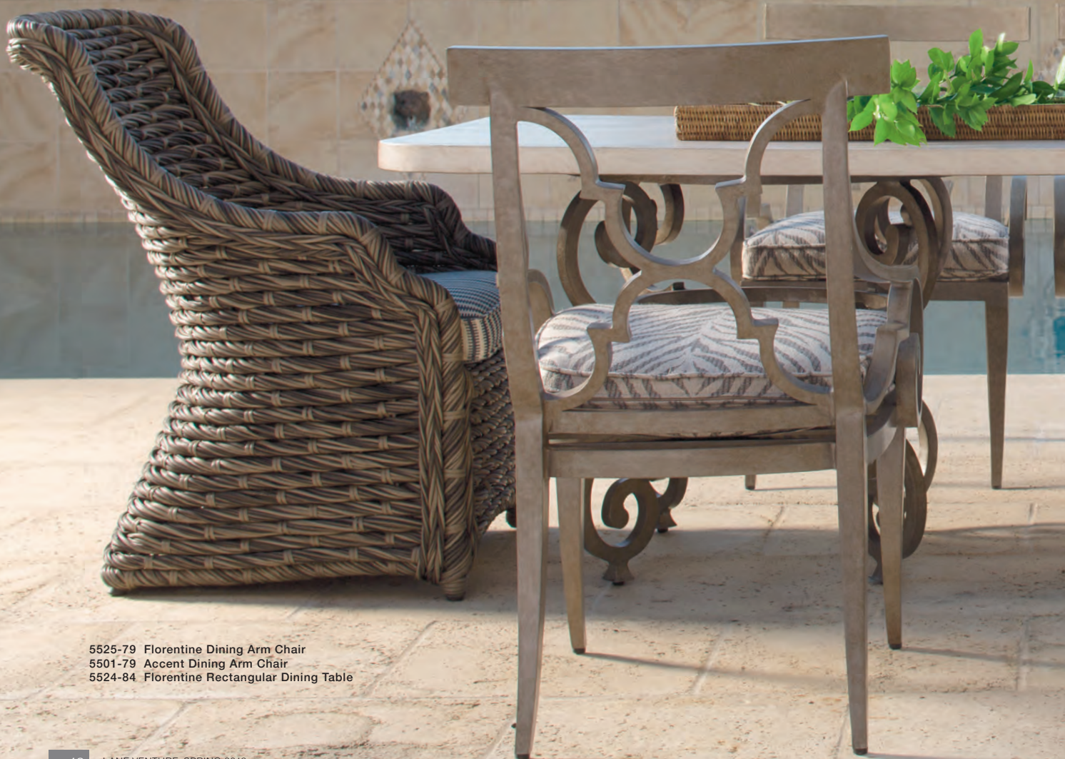
5525-79 Florentine Dining Arm Chair 5501-79 Accent Dining Arm Chair 5524-84 Florentine Rectangular Dining Table