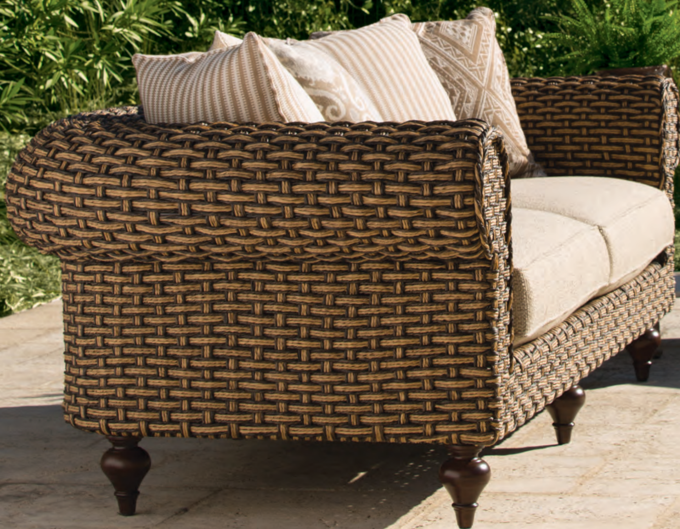
5511-03 Chesterfield Sofa