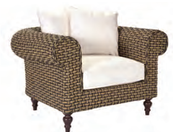
5511-01 CHESTERFIELD LOUNGE CHAIR