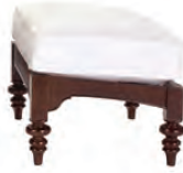
5512-05 MORRIS CHAIR CANTED OTTOMAN OVERALL: W30 D23 H20 MATERIALS: Cast aluminum powder-coated frame. FINISH: Walnut finish with warm highlights. Available only as shown.