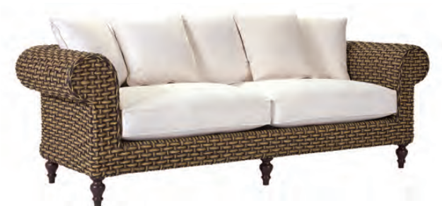
5511-03 CHESTERFIELD SOFA

FEATURES: Cast aluminum turned legs, 4 pillow back.