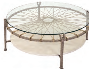
5507-25 ROUND COCKTAIL TABLE OVERALL: W46 D46 H19 MATERIALS: Cast & wrought aluminum frame. Tempered glass top, synthetic wicker weave. Glass reinforced concrete bottom shelf. FINISH: Hammered Gun Metal finish. Available only as shown. FEATURES: Synthetic cording in tribal "drum" pattern. Suspended tempered glass above the woven décor. Cast aluminum legs.