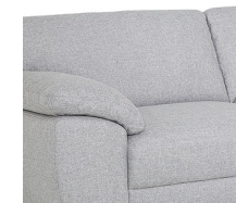
SEMI-ATTACHED BACK AND SEAT CUSHIONS

Please note that the following SKUs shown on this document have been discontinued: 01, 95 These will be removed as soon as possible.