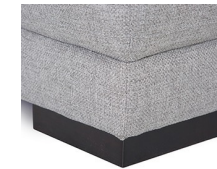
ESPRESSO WOOD LEG