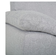
PILLOW TOP ARM