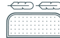
FEATHER FIBRE TOPPER WITH FOAM