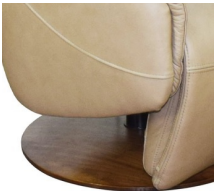
WALNUT WOOD PEDESTAL OPTION

Aluminum Brushed Metal Leg Aluminum Black Leg Wood Base