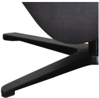
BLACK ALUMINUM PRONG BASE OPTION