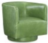
SKU L7777-05SW Upton