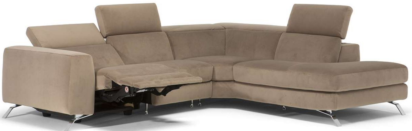
■ Vers. 182+201