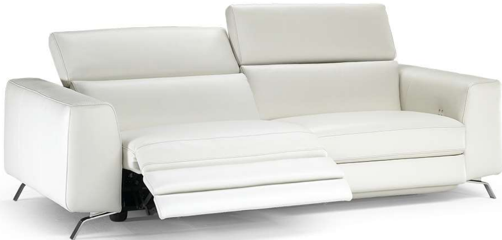
■ Vers. 446