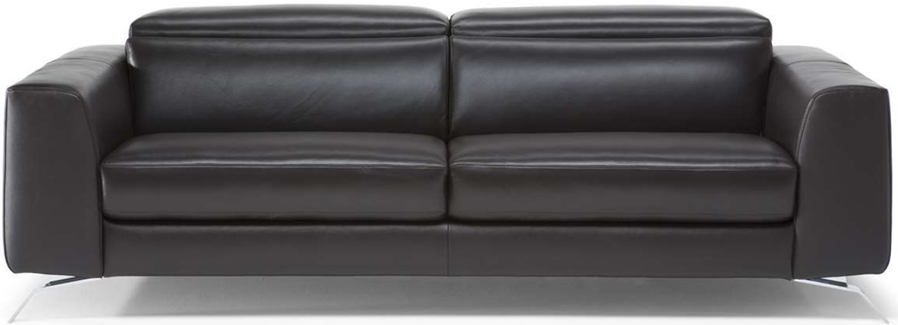
■ Vers. 009