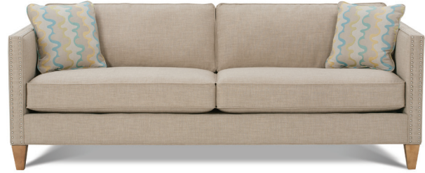
2 back over 2 seat cushion option

Shown in fabric 14999-64, toss pillow fabric 26379-34, pewter nailhead. Washed Pine wood finish.